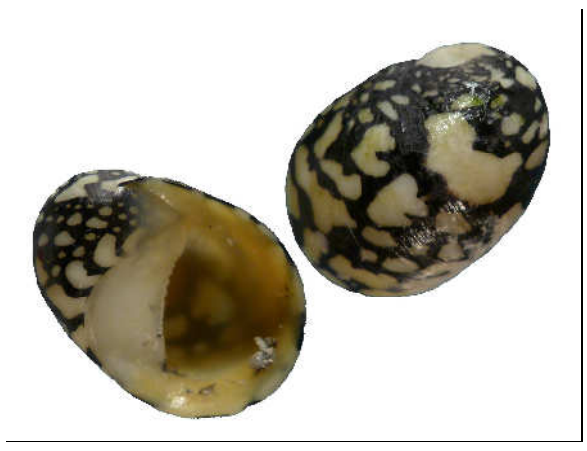
Figure 3: Puperita bensoni (Neritoids)

Participants struggled in identifying most of the taxa as lot of them did not have specialized knowledge or background in malacology. Moreover, lot of species were not clean or in good enough condition for their characteristics to be visible.