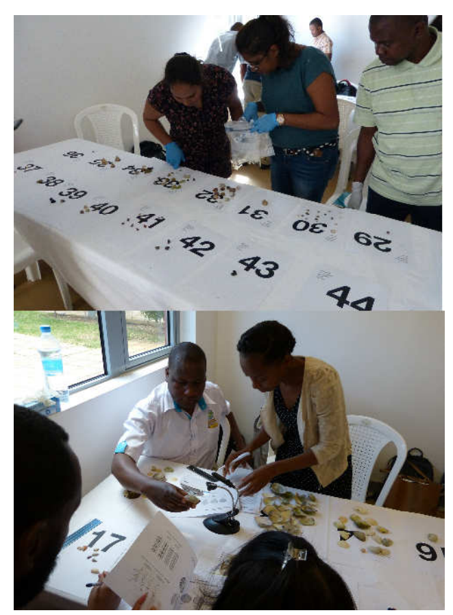
Figure 2 : sorting and identification of the specimen