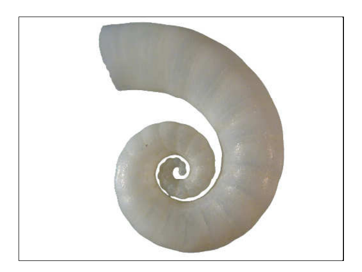
Figure 5: Spirula spirula