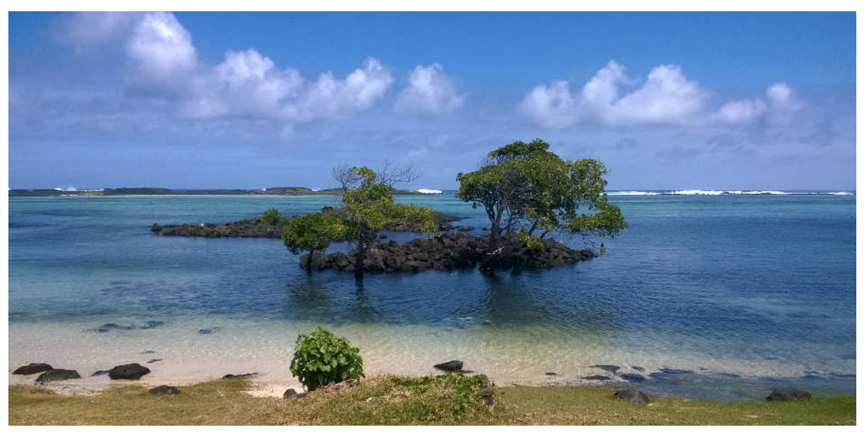
Figure 1: Le Bouchon sampling site

IOC Biodiversity and MOI organized a regional workshop in Mauritius in October 2017 for 4 days. The main objective of the workshop were (i) to train regional marine biologists to the taxonomy of molluscs, (ii) to build capacities in the description and identification of molluscs, (iii) to assess the mollusc biodiversity and its evolution in tropical marine ecosystems.